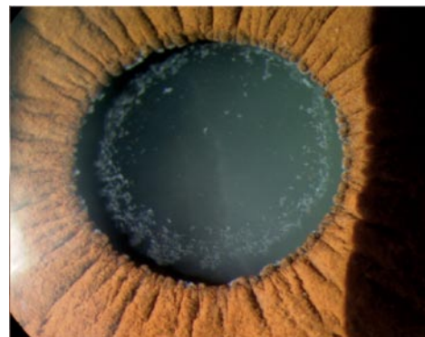
FIGURE 1 Small pupil in a patient with pseudoexfoliation syndrome after maximum pharmacological dilation.

a recent comparison of four methods of pupil dilation, the authors found that, although time-consuming, iris-retractor hooks and a PMMA pupil-dilator ring were the most effective systems for maximizing pupil size. 4 These are good choices for eyes that require a pupil diameter of 5.5 mm or more. Of the devices studied, the pupil-dilator ring caused the least iris trauma. The authors noted that the Beehler pupil dilator and bimanual stretching were also effective, as well as quick and easy to perform.